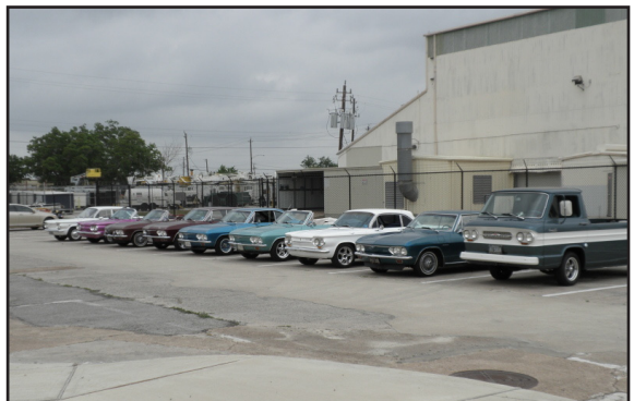
Wings & Wheels display for Corvair Houston